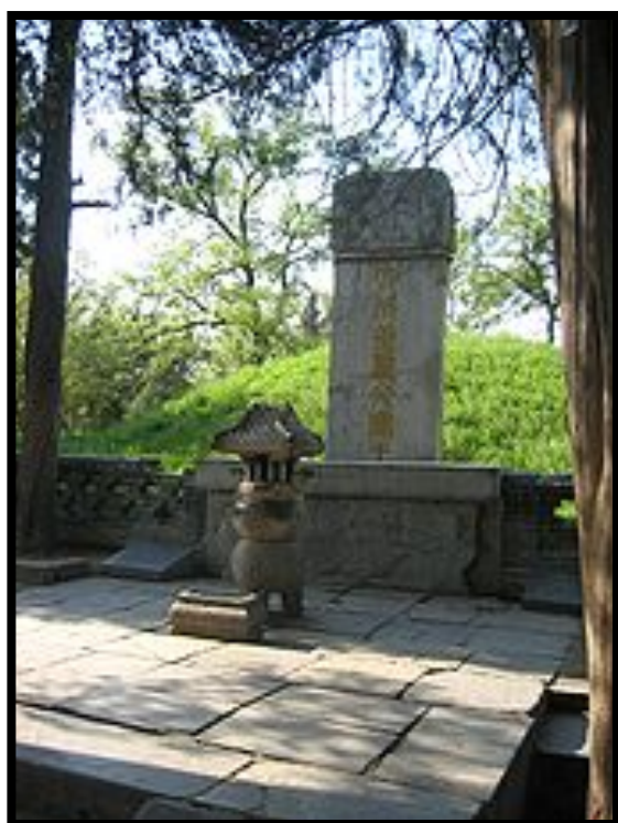
The tomb of Confucius