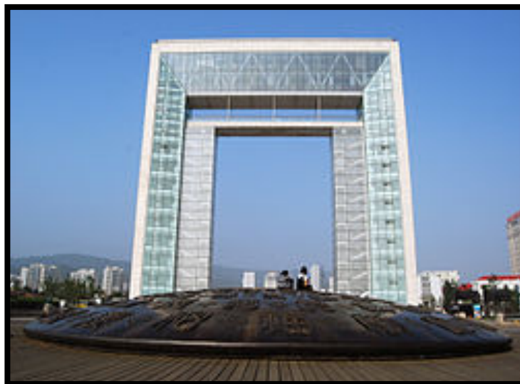
The Happiness Gate - the landmark of Weihai