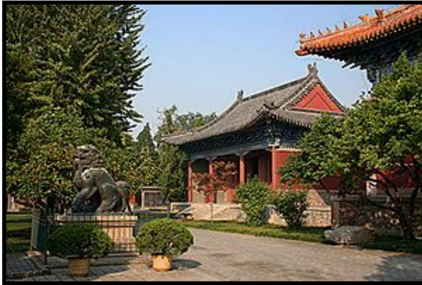
The Dai Temple at Tai Shan