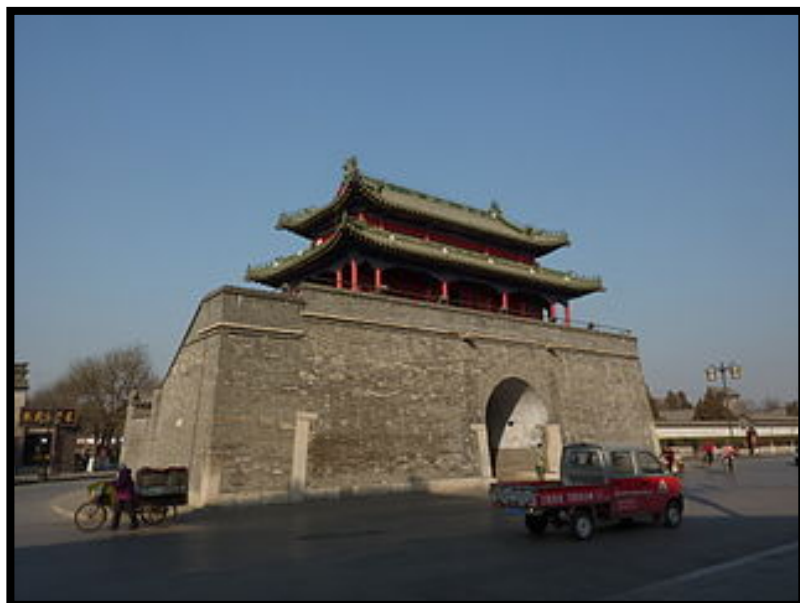
Qufu Drum tower - the centre of the Walled City